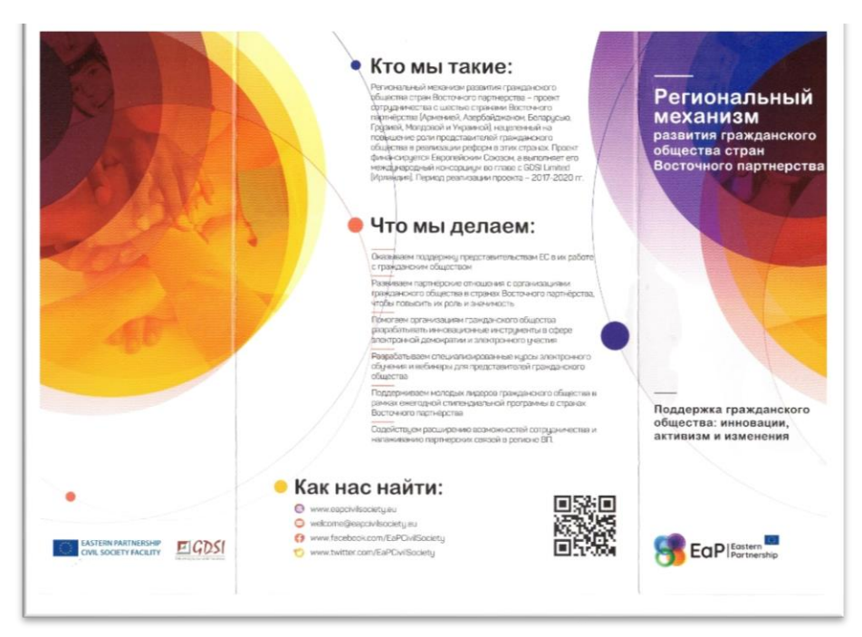
With a leaflet, the EaP informs about their goals and achievements. For its citizens, Russian is historically the most common and connecting language