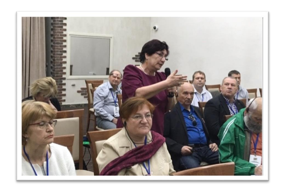
The country presentations are being questioned

In this, the "1st Forum" of its kind, according to the view of the manager and her team, the situation of older citizens in each country should be discussed. And so it came gushing out of the mouths of the speakers of eleven organizations and associations, just as if they had long been waiting for this opportunity. Embedded in the presentation of their homelands - historically, geographically, administratively, ethnically and sometimes politically - it became quite specific.