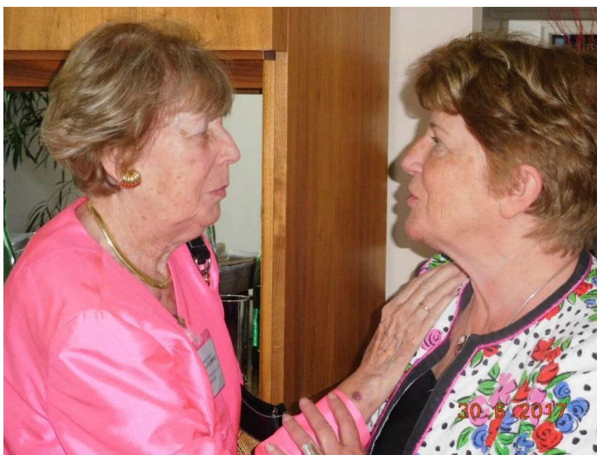
The jubilee lady with the ESU President (taken in 2017)

The Viennese lady has been the “soul” of the ESU Summer Academies in her city for almost ten years; she is valued as a committed member of Working Group I of the European People's Party, and is a senior officer of the Austrian Seniors' Association who often speaks “in plain language” when others bite their tongue.