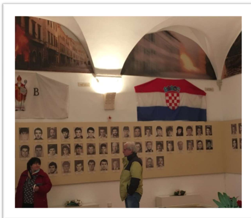
In Dubrovnik, Croatia, a memorial commemorates the names of the 200 soldiers killed during those terrible times.

Here in Montenegro, the southernmost and smallest of the West Balkan countries visited, one pays with EURO; neighbouring Bosnia and Herzegovina, on the other hand, is not part of the Eurozone (currency: Convertible Mark of 100 Fening) or the EU, and while Croatia still has the Kuna as its currency, it has already achieved the desired goal of becoming a member of the EU. Montenegro is currently being granted the greatest opportunity to meet the European Union's admission criteria.