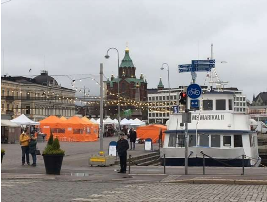
From here the excursion boats to the Suomenlinna fortress start