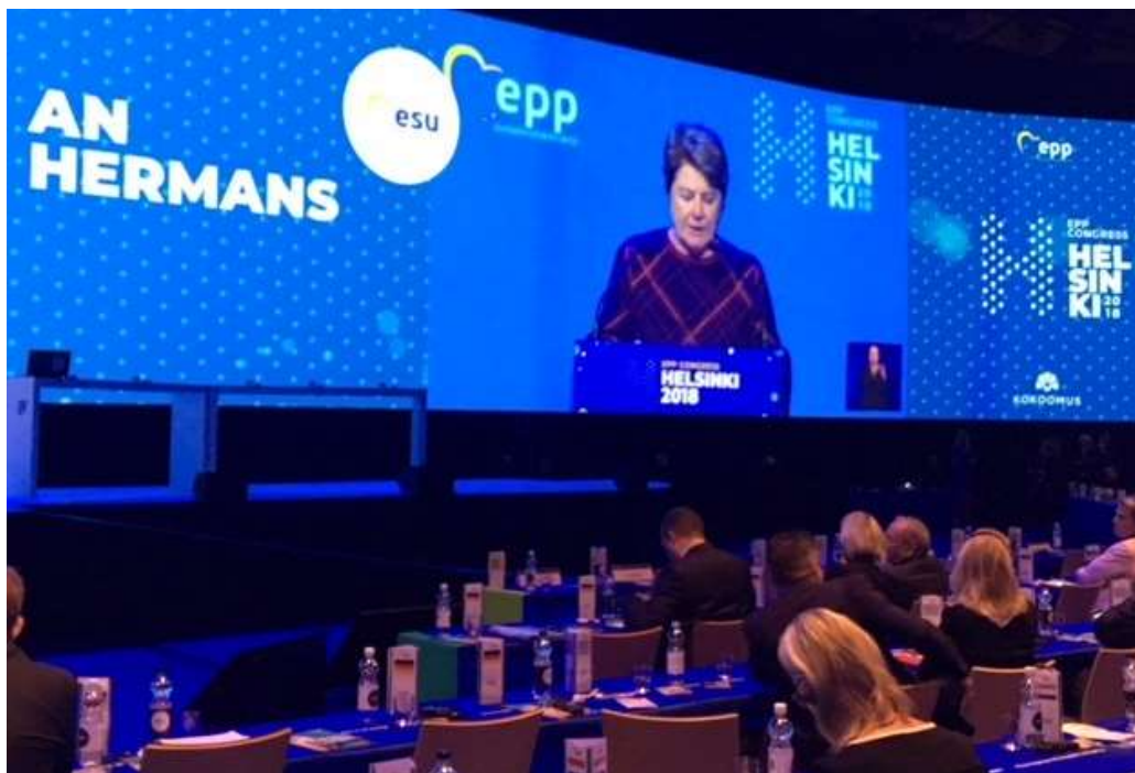
The ESU President during her speech at the plenary session