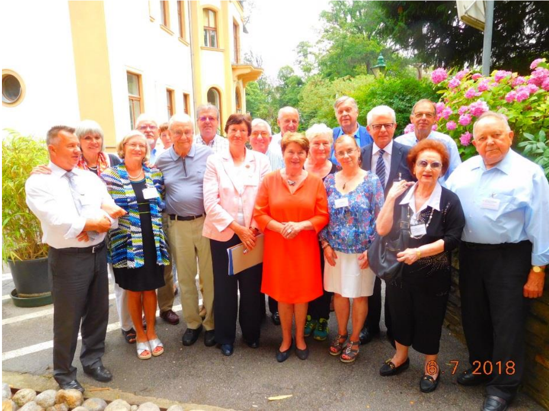
Participants of the Praesidium meeting