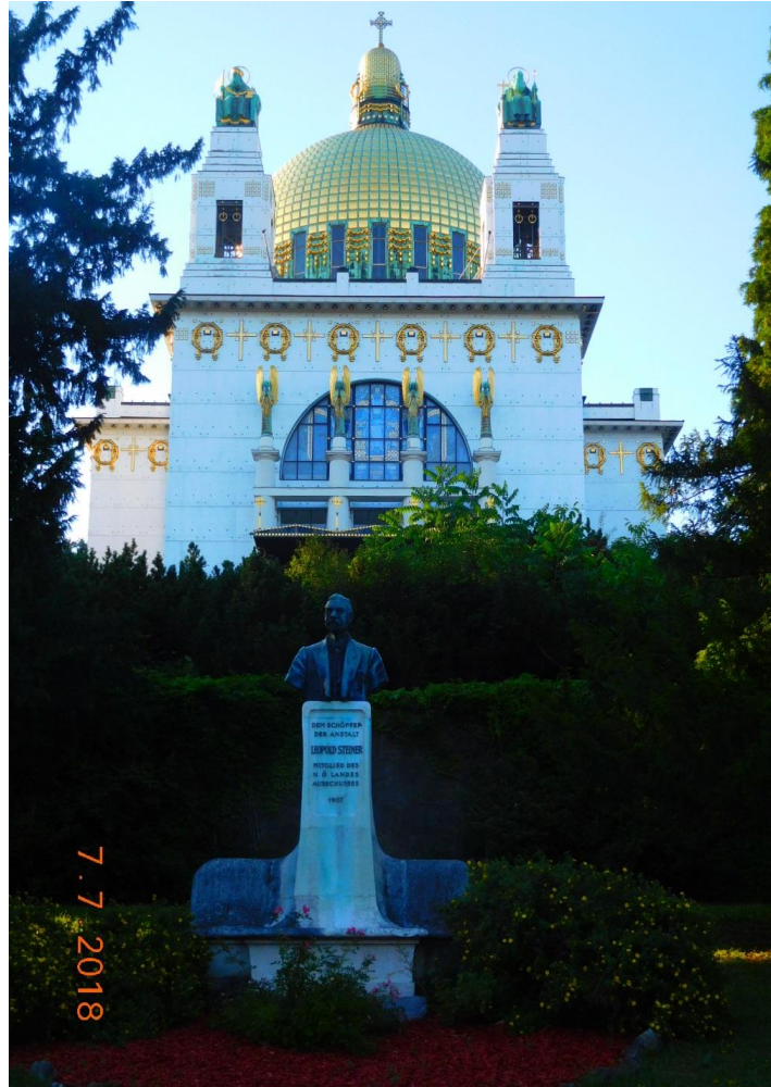
A highlight in the cultural city of Vienna: the church dedicated to Saint Leopold, one of the finest art nouveau-style constructed churches in the world

- End of the report about the Summer Academy –