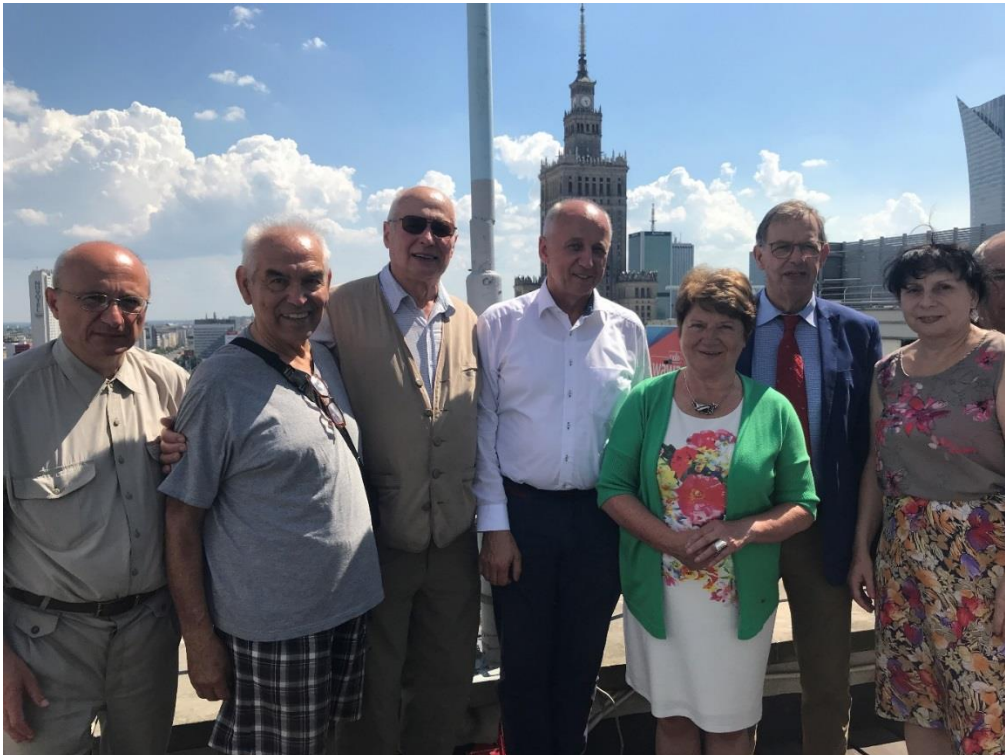
The Polish metropolis from a rooftop. The guests from Brussels attended a conference of the Political Assembly of the EPP in Warsaw.